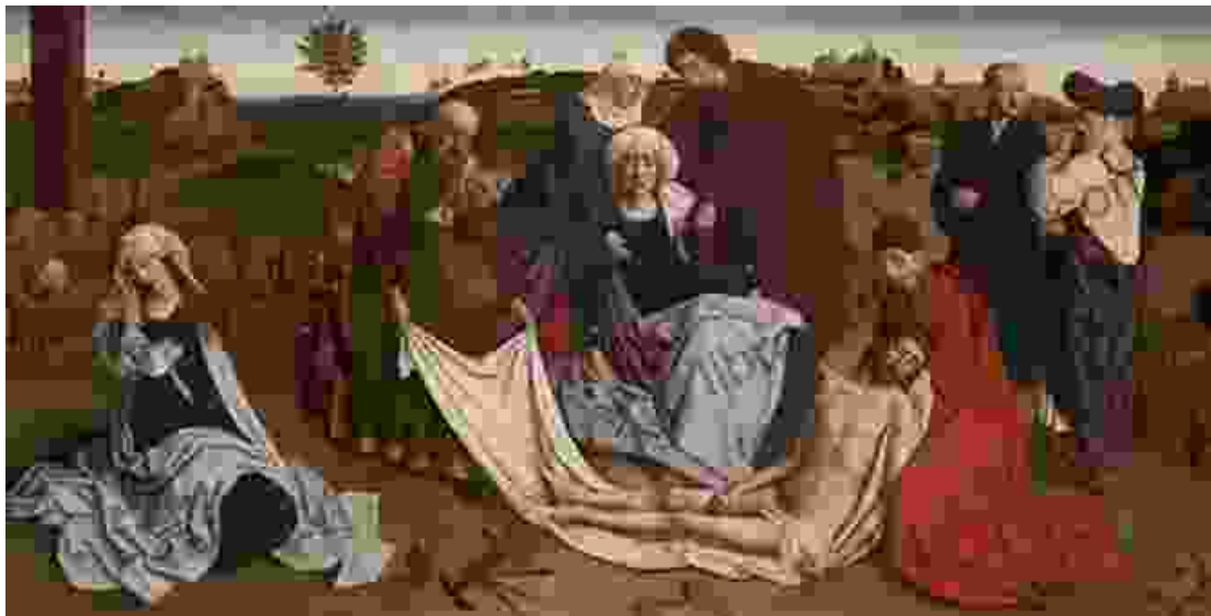
The Lamentation of Christ by Van Dyck

Accompanying these magnificent images are insightful essays by leading art historians, who provide expert commentary on Van Dyck's technique, influences, and the historical significance of his work. These essays delve into the social, political, and religious context of the Baroque era, enhancing your understanding of Van Dyck's art and its impact on Western culture.