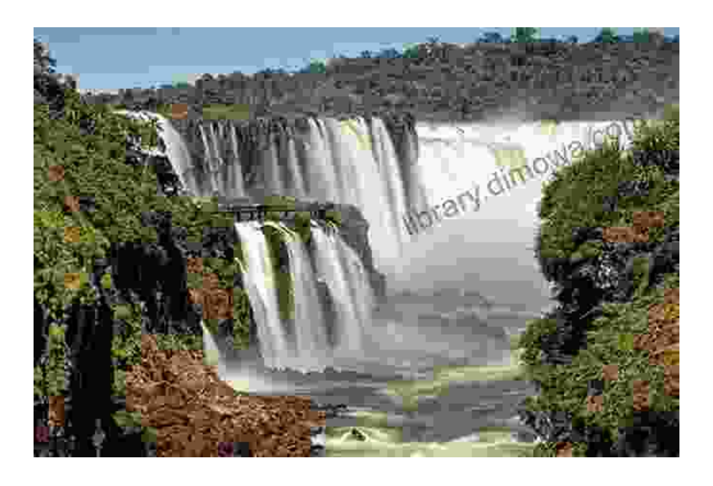
The Devil's Throat, a mesmerizing and thunderous spectacle