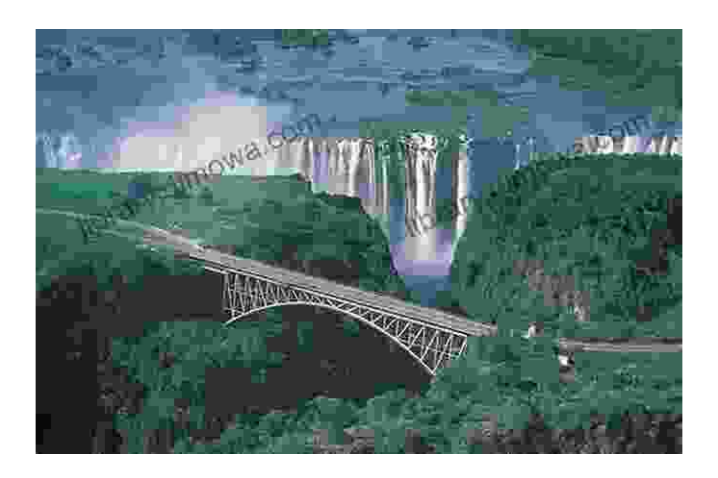
The Zambezi River, one of the longest rivers in Africa

The Zambezi River is the fourth longest river in Africa, and it flows through Zambia, Angola, Namibia, Botswana, and Zimbabwe. The river is home to a variety of wildlife, including hippos, crocodiles, elephants, and lions. You can take a boat ride down the river, go fishing, or relax on the banks and enjoy the scenery.