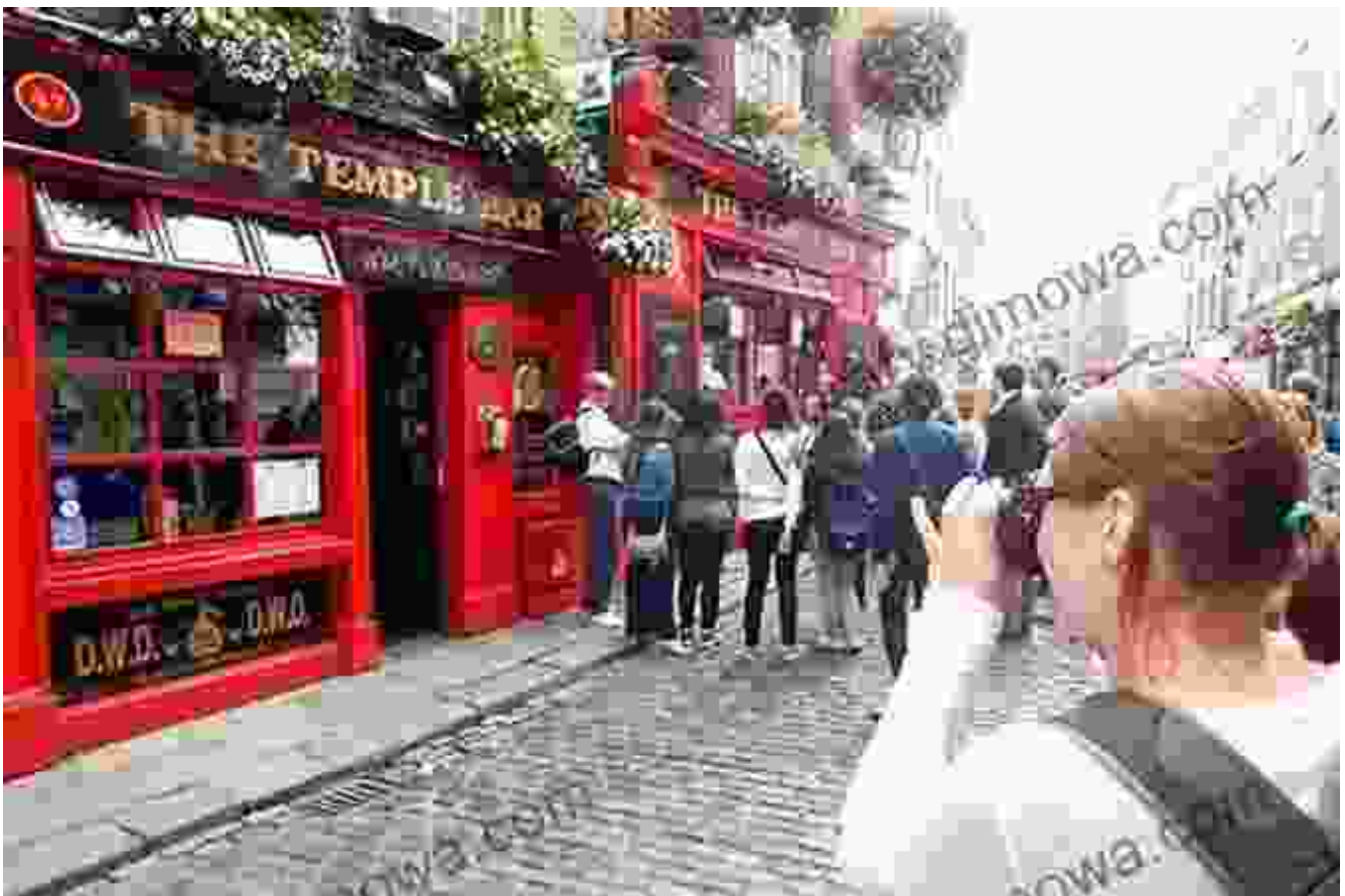
Dublin on a Budget